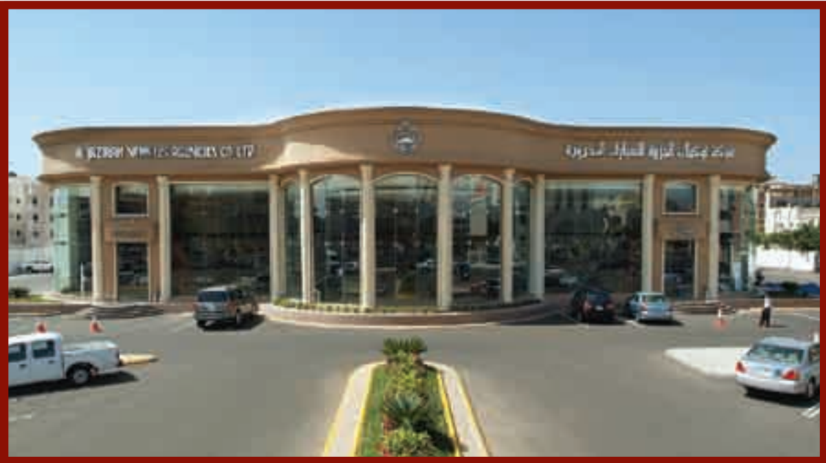
Headquarters of Al Jazirah Vehicles Agencies Co. in Jeddah city, West of Saudi Arabia