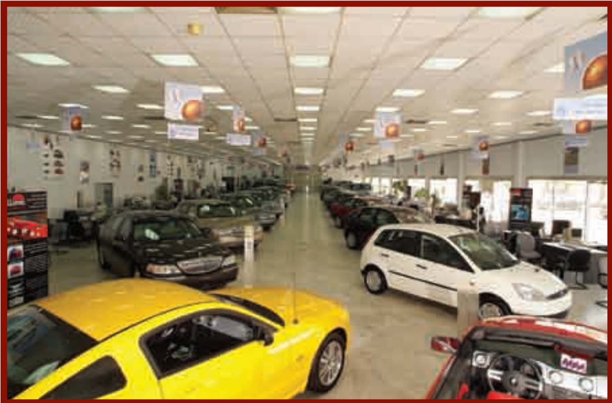
Al Jazeera Vehicles Agencies Co. headquarters in Riyadh

and nearly Ford 500. in the 4x4 we have Explorer, Expedition, Expedition EL, and nearly Edge, in addition to Ford superior truck F150, and pickup ranger. In the luxury car sector, we have Lincoln, Navigator, Town Car, and nearly we will receive MKX. Of course the highest sales are for Crown Victoria. Our company is the biggest agent for Crown Victoria worldwide for the ninth year consecutively, in addition to Focus, Mondeo, Explorer and Expedition.