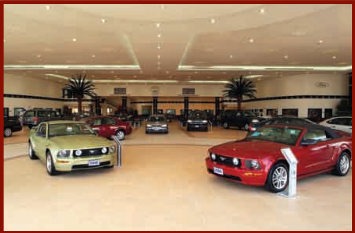
A showroom for Ford vehicles at Al Jazirah Vehicles Agencies Co.