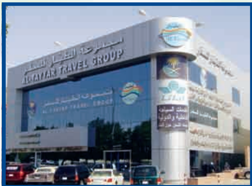
Head Office, Al-Tayyar Travel Group, Riyadh City.