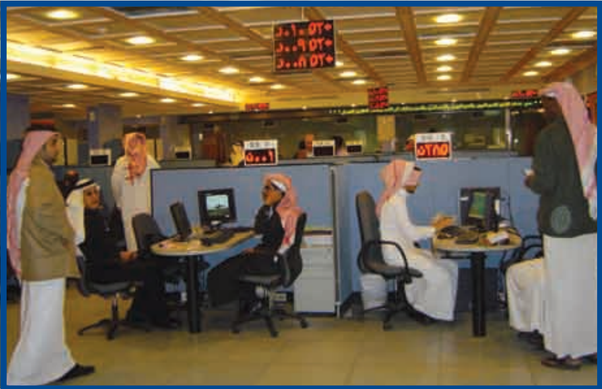
A picture of the main booking lounge where it shows the distinctive Saudi national while he is involved in serving passengers through PC technology.