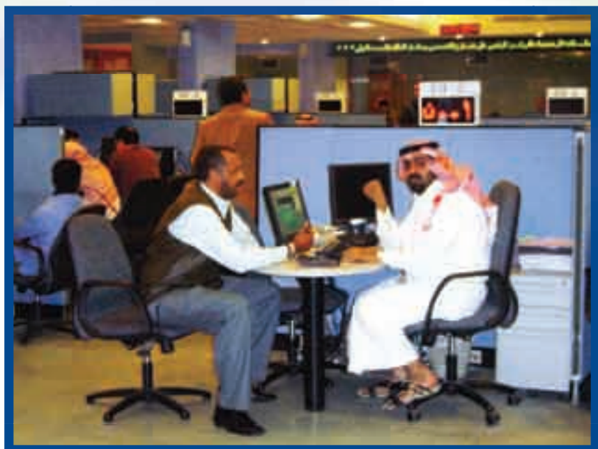
A picture of one of Al-Tayyar Travel Group's service areas.

Al-Tayyar Travel Group is considered the main executive of Saudia World Program; it is from the greatest companies of tourism export in all it kinds; great, mid, etc. to many countries as Egypt and Malaysia. We have obtained many prized in this regard as the prize of the best agency by Malaysian government in 2005. This is because of our great concern of tourism as a developed and changed activity. Also, Saudia works to issue licenses and techniques for