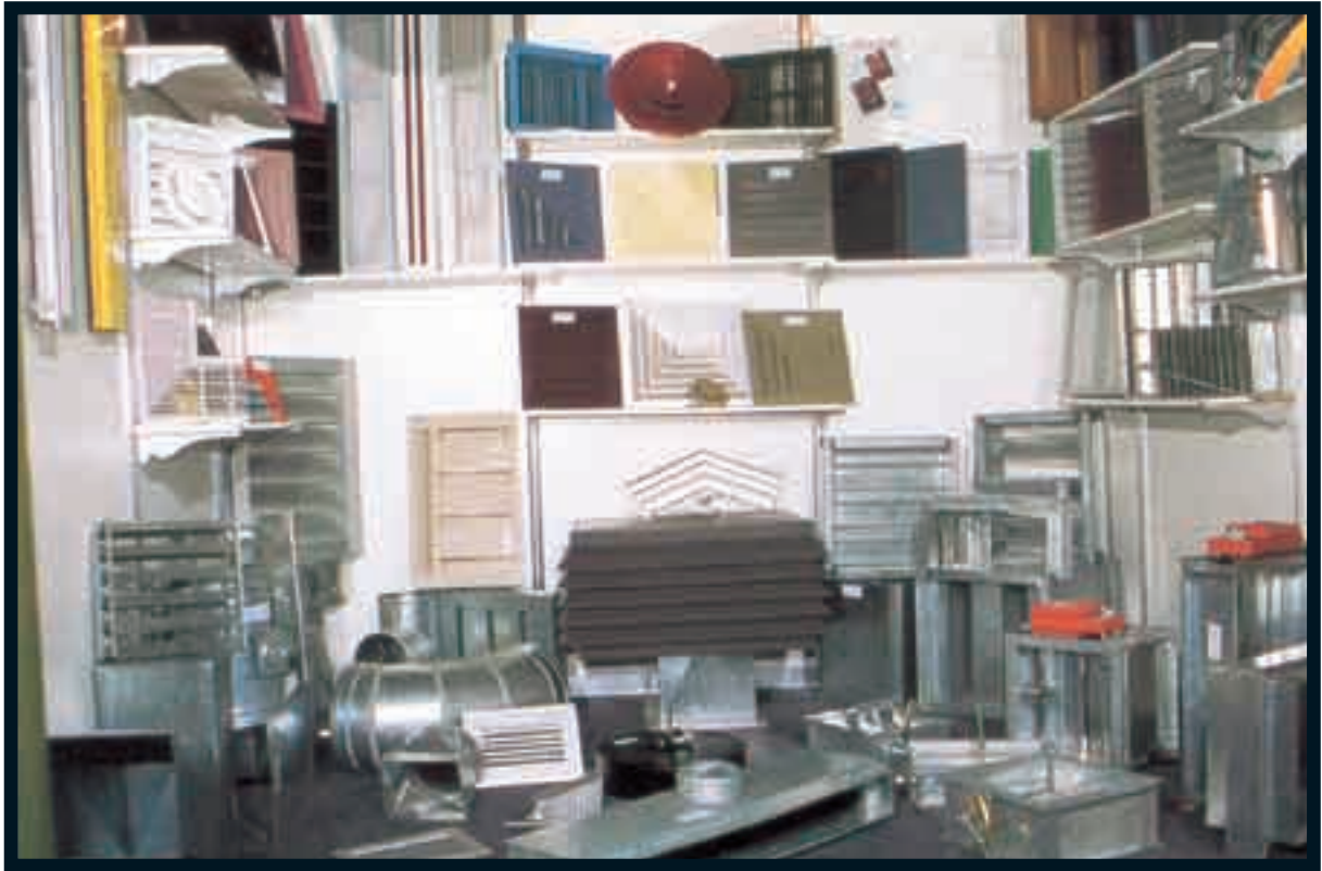
Part of Naniah Factor products for Air Condition Supplies & Accessories

HRH Prince Salman bin Abdulaziz governed Riyadh over 53 years, and this event addresses 50 years of achievements, including oil, industry and real estate, etc. What is your message for the role performed by HRH prince Salman during 50 years?