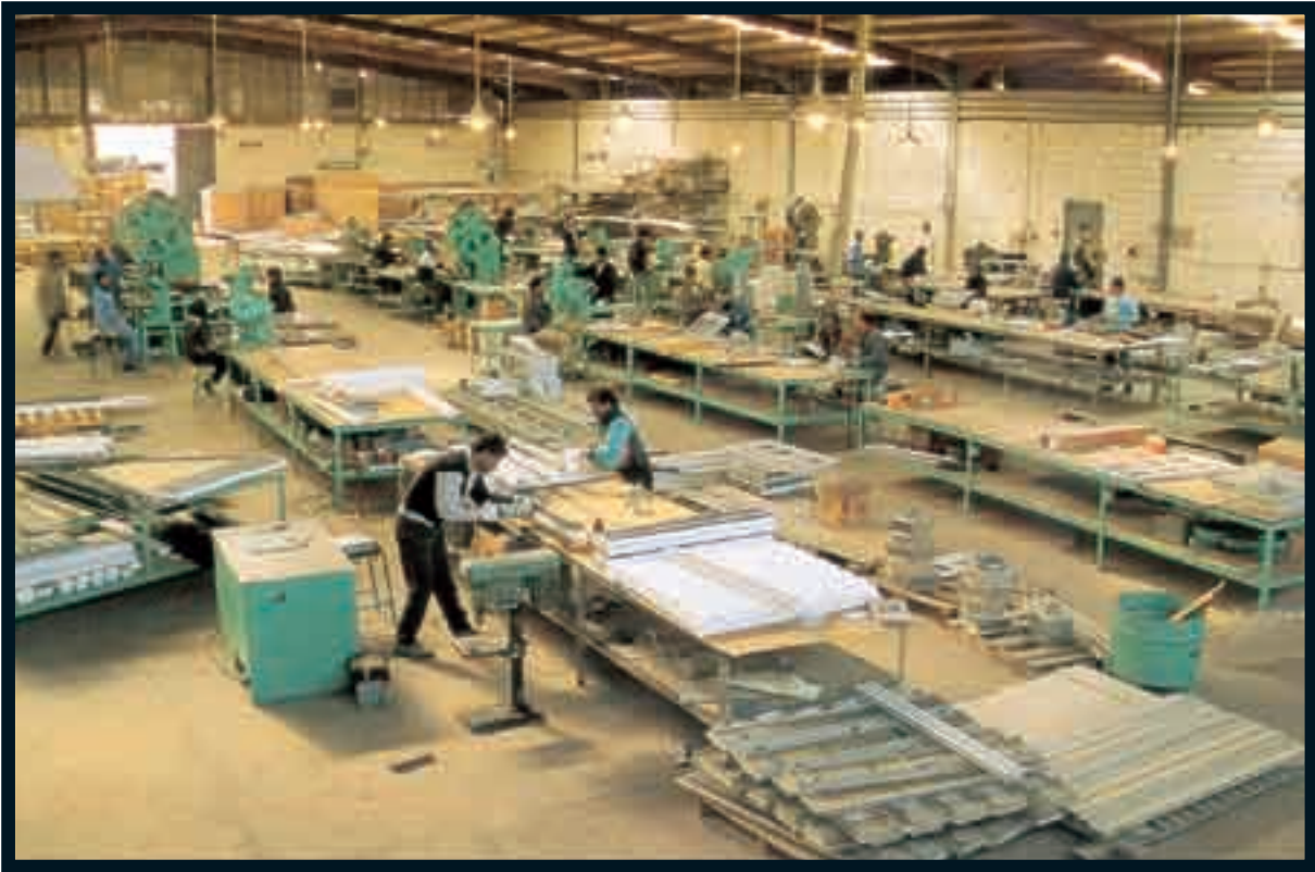
Aluminum section (Grills – Diffusers)

What is the approximate sales volume for your group as a whole up to the end of 2006?