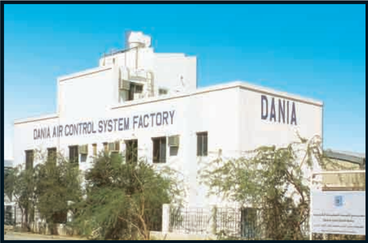
Headquarters of Dania Air Control System Factory in Riyadh